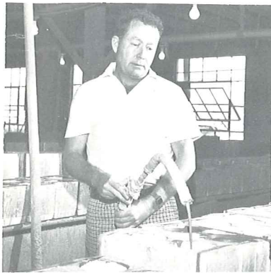
(1) Slip Casting