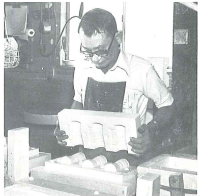
(8) Making a Mold