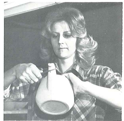
(4) Trimming with knife.