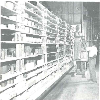
(7) Stacking kiln for firing.